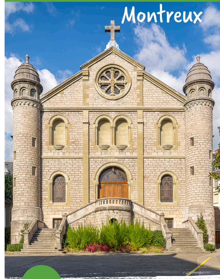
Service communication ECVD, 2024